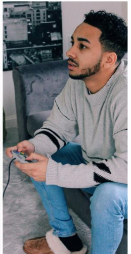
Hey Teen Writers, hope these prompts spark your imagination, remember to have fun!